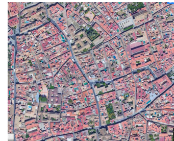
Urban Fabric, Granada