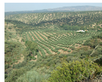
Landscape of the Dehesa, Sierra Nevada Mountain Range